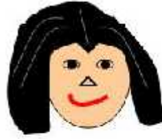
Hairline with widow's peak